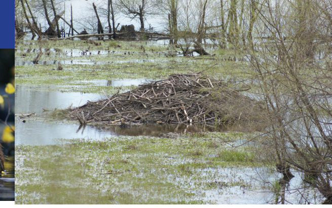
Dam located on Old Weaver Trail just outside Creedmoor, N.C.

that busy-ness? But does this explain the beaver's odd behavior?