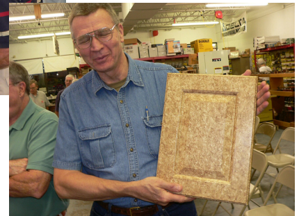
Meeting Candida