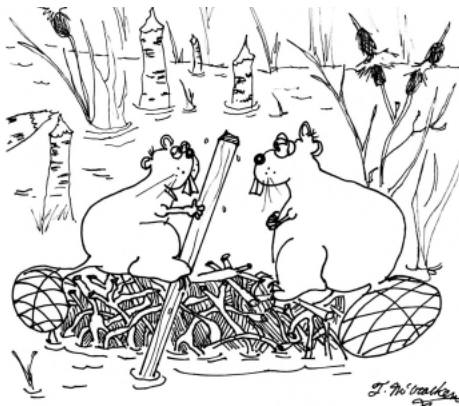
"I just don't understand what the big deal is about kiln dried lumber."