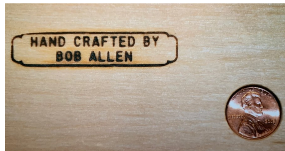
Show and tell: George's seventh grade project and Bob's beautiful live-edge table, along with a close-up of Bob's signing and dating method