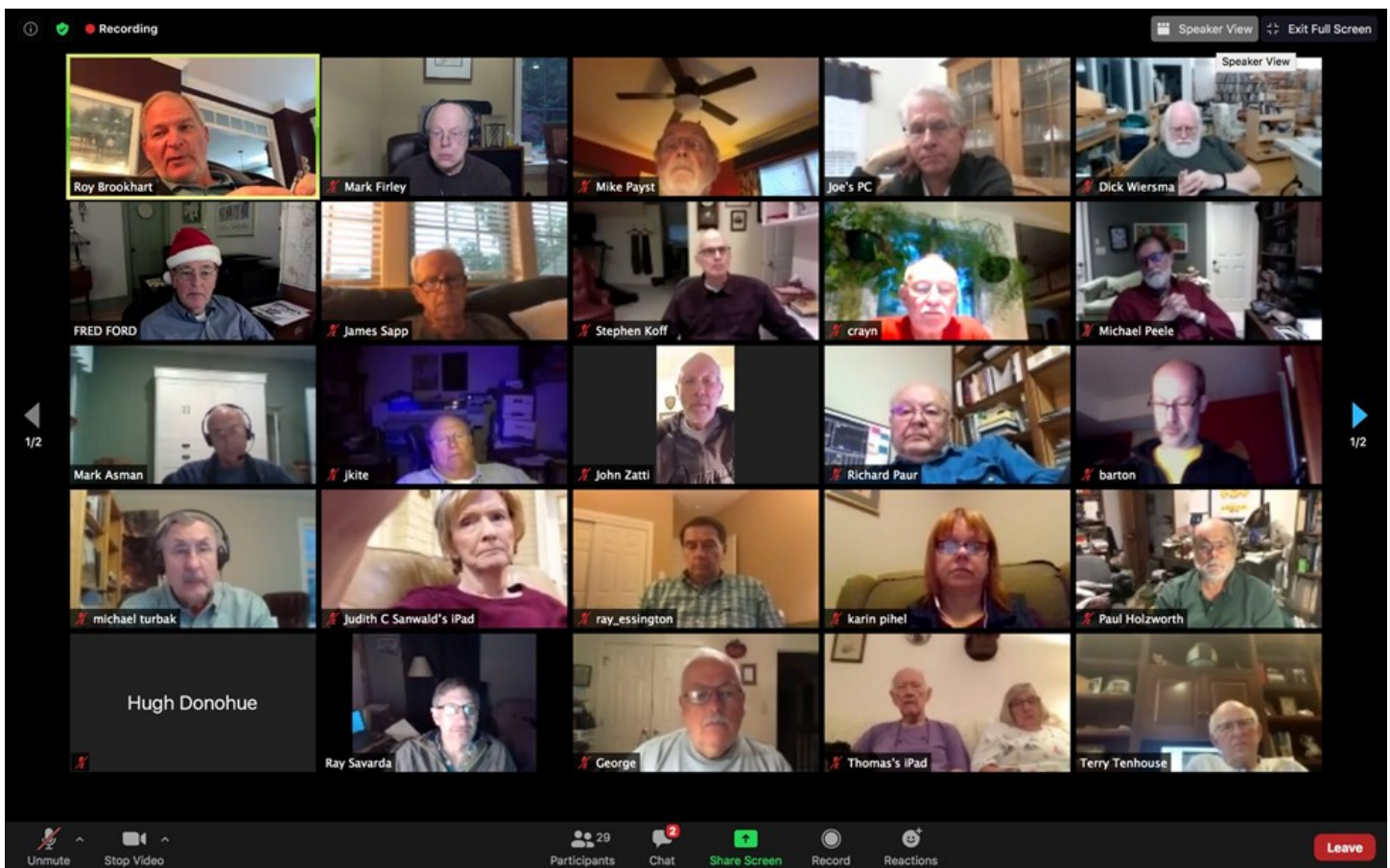
TWA members were happy to meet via videoconference after a long break

Concluding comments: The virtual meeting exceeded our expectations in attendance and quality of transmission. Roy suggested members who attended to spread the word to other members how well it went and to suggest they consider attending the next meeting.