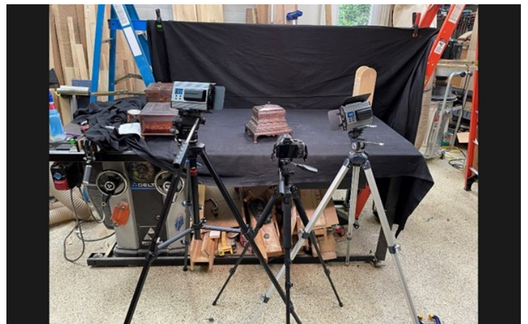
Photos from Mark's box collection and Mark's photography set-up