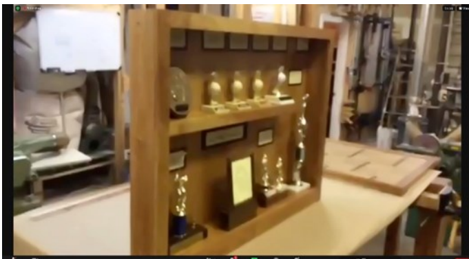
Cecil showed this beautiful display case that he built

This meeting will be held using a combination of in-person at Klingspor's and online using Zoom.