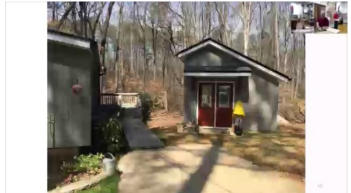
Barton’s shop build

in use to protect it from other activities that occur in the room where it is situated. The cabinet is massive in size and weight, requiring Mark to build in sections to be assembled on site. Mark noted he wrote up detailed instructions on how to disassemble/assemble the cabinet if the need ever arose.