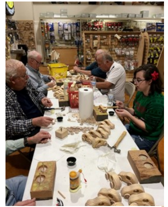
TWA club members building 983 wooden cars for Toys for Tots at the Klingspor's workshop in December