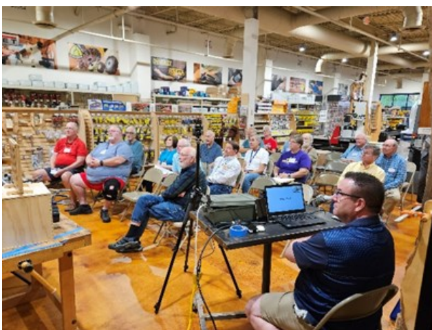
The April meeting was held at Klingspor's