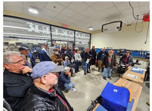
There was a big turnout for the January meeting

birch plywood. There is an in-store classroom complete with tooling, benches and dust collection. Rockler holds frequent classes in the store and has 34 courses scheduled through February. One on one training is also available. To register for courses, go to Rockler.com/classes or talk to a sales associate in the store.